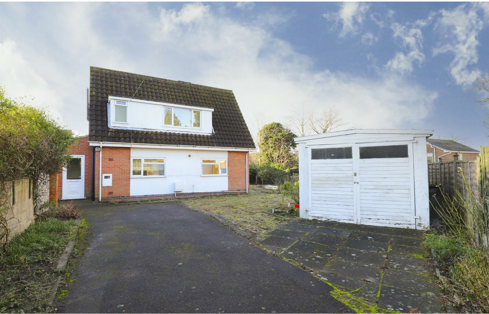
Cross Street, Arnold, Nottinghamshire NG5 7AT